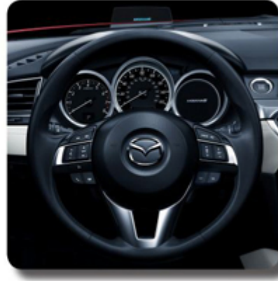
Steering Wheel After Cleaning

Some vehicles may exhibit wear/peel-off of the leather steering wheel surface causing a poor appearance. This concern may be caused by an insufficient wear resistance of the steering wheel surface.