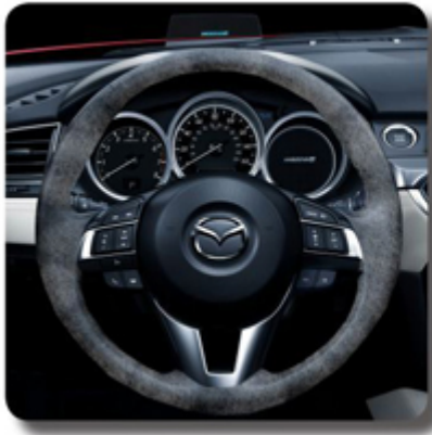
Steering Wheel Stained