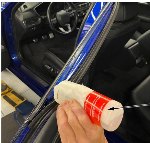
SOAP AND WATER Place solution in channel and on weatherstrip.