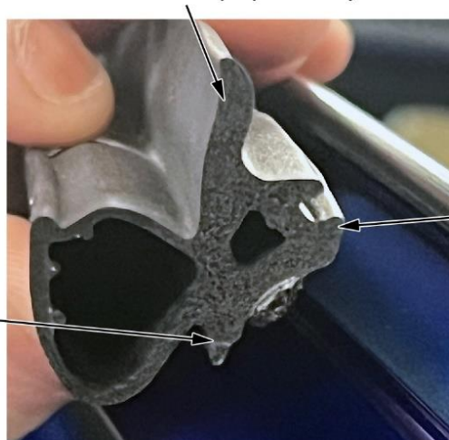
LOWER EDGE Ensure lower edge is inside channel.