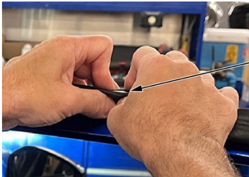
Pinch to aid in placing edges into the channel.

NOTE: Ensure both edges of the weatherstripping are firmly installed into the channel of the door frame.