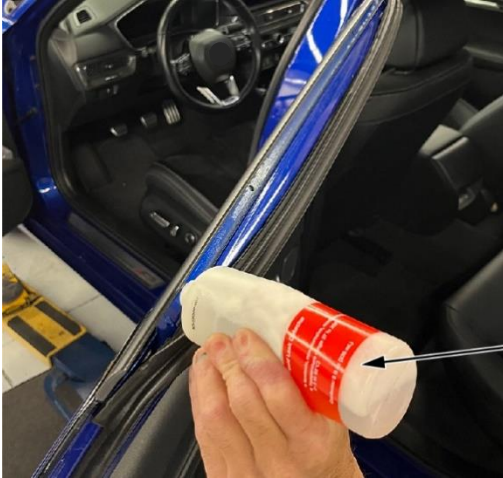
SOAP AND WATER Place solution in channel and on weatherstrip.