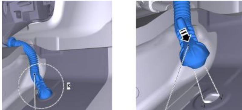
Figure 1. Assembly overview for the Audi Q4 e-tron.

Figure 1 shows the assembly overview of the Audi Q4 e-tron.