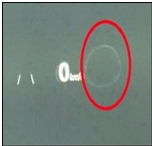
A circle is displayed

Some vehicles may exhibit a partially missing image (shown in the circles below) from the Active Driving Display (ADD) on the front window and/or display.