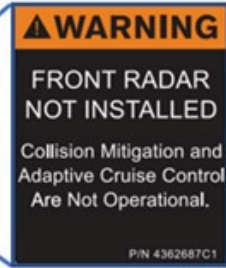
Figure 2. Warning Label