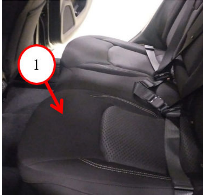
Fig. 1 Rear Seat Cushion