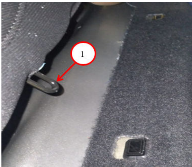
Fig. 4 Rear Seat Cushion Locks

6. Lower down the rear seat cushion to its installed position and engage both seat cushion locks Fig. 4 .