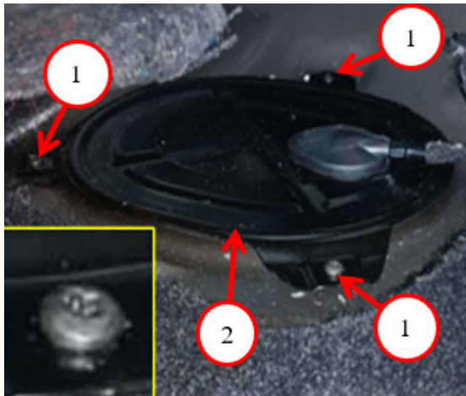
Fig. 2 Fuel Pump Access Cover Screws