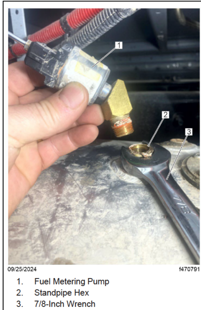
Fig. 2, Auxiliary Heater Fuel Metering Pump Removed