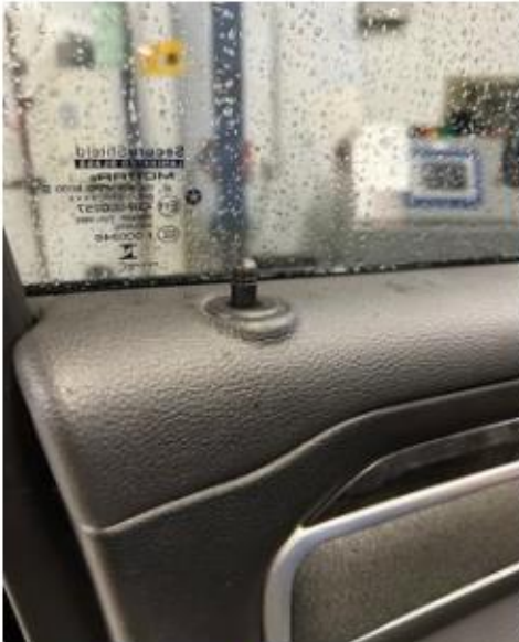
a. Unlocked Position

-If no actuator motor sound is heard, then disconnect the connector to the latch and reconnect. If latch still not functioning properly, then remove and replace the latch.