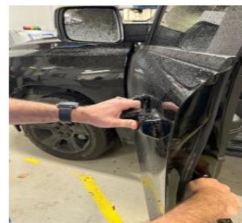
B. While pushing the screwdriver in the catch to open, pull on the outside Handle.

This document does not authorize warranty repairs. This communication documents a record of past experiences. STAR Online does not provide any conclusions about what is wrong with the vehicle. Rather, it captures all previous cases known that appear to be similar or related to the vehicle symptom / condition. You are the expert, and you are responsible for deciding on the appropriate course of action.