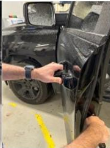
E. While pushing the screwdriver in the catch to open, pull on the outside handle.