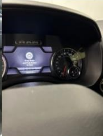
C. Confirm ajar light is now off.