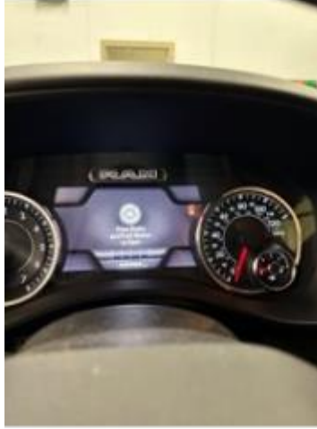
A. Open door and see door ajar light.