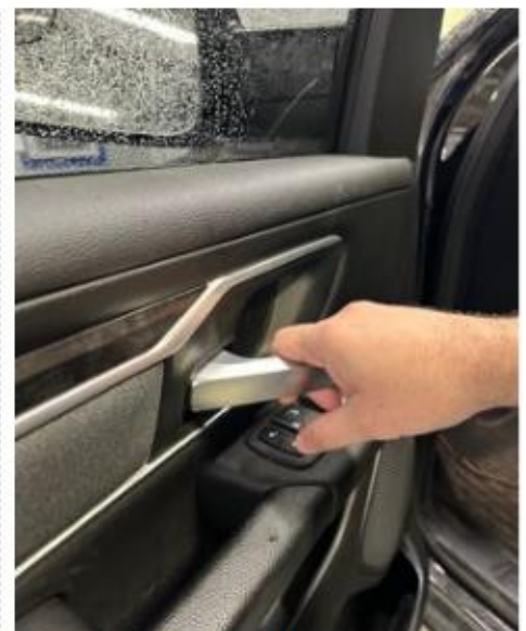
c. Pull Inside Handle to move lock knob to unlocked position.