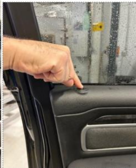
b. Push to locked position