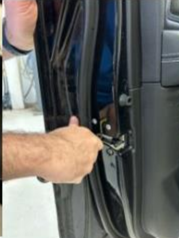
B. With screwdriver bring latch catch to primary position. Ensure catch cannot open.