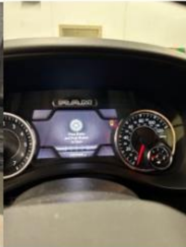
F. Confirm ajar light is now on. You can now close the door.

This document does not authorize warranty repairs. This communication documents a record of past experiences. STAR Online does not provide any conclusions about what is wrong with the vehicle. Rather, it captures all previous cases known that appear to be similar or related to the vehicle symptom / condition. You are the expert, and you are responsible for deciding on the appropriate course of action.