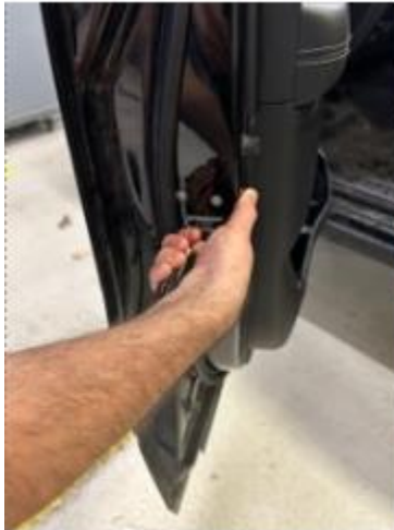
D. Insert screwdriver into catch fishmouth .