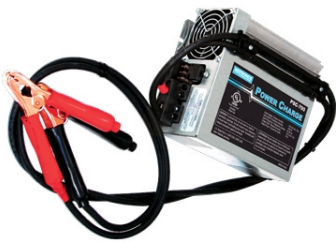
Battery Charger / Power Supply

Every technician using this recovery equipment needs to be certified to recover refrigerant by the EPA – Section 608 Technician Certification, see the EPA website ( https://www.epa.gov/section608/certification-programs-section-608-technicians ) for a local program near you.