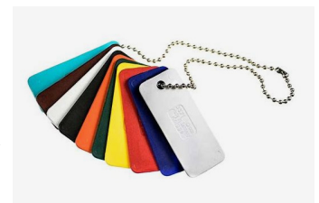
Body Gap Gauges

Common electric tools to assist in testing and diagnoses, such as terminal release and testing tools from sources such OTC.com, would be required if not already owned by a competent technician.