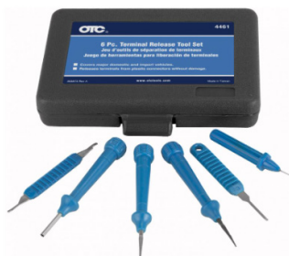
OTC 4461 Terminal release tool set, OTC 3587 Terminal Test Kit