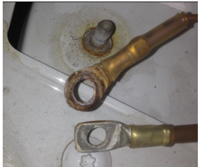
Figure 2 – Example of corrosion on ground point