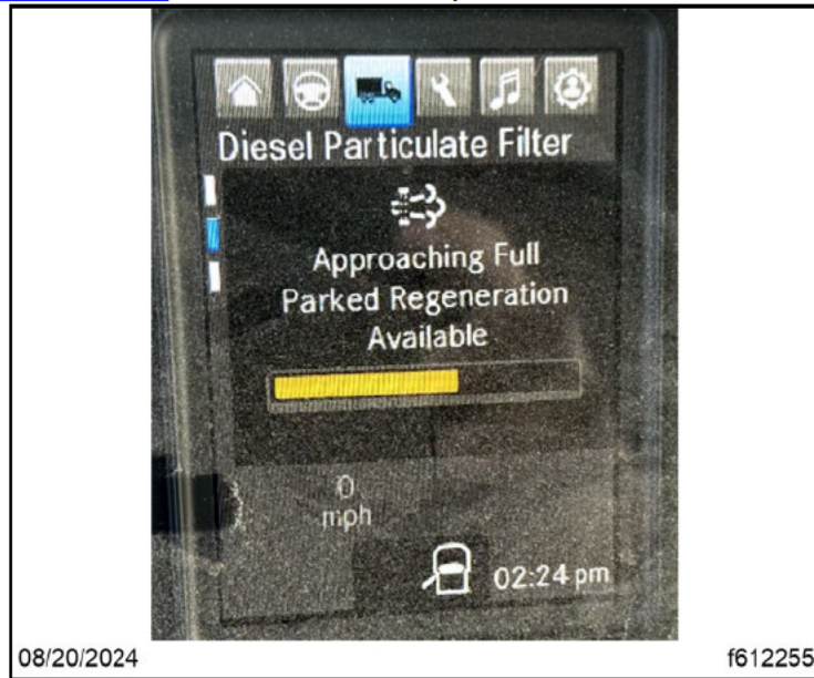
Fig. 1 Disabled Manual Regen Virtual Switch

M2 Plus and SD Plus vehicles built from May 9, 2023, through March 28, 2024, and equipped with a Cummins engine may experience an issue where the virtual regen request switch is not enabled in the ICUC, preventing the driver from manually requesting a regeneration. See Fig. 1 and Fig. 2 . Refer to Freightliner publication TSB 54-371 for instructions to update the ICUC.