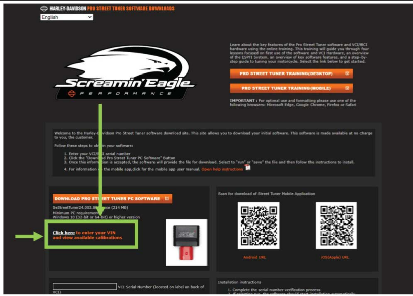
Figure 1. Link Location