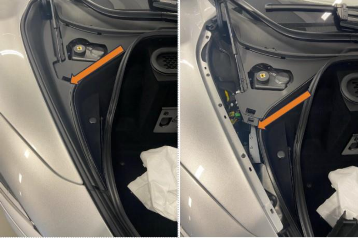
5. Install edge protector to the luggage compartment trim making sure it is fully secured