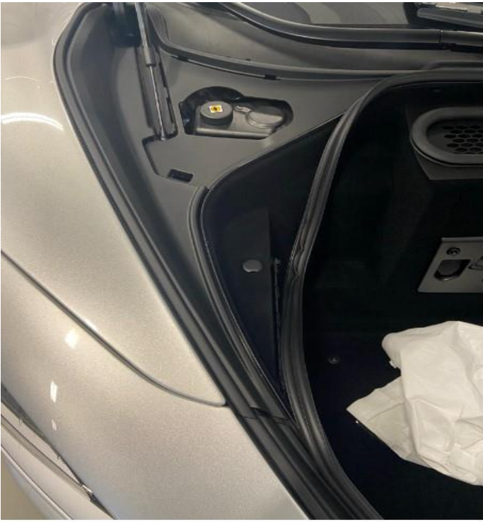
4. Remove panel cover complete