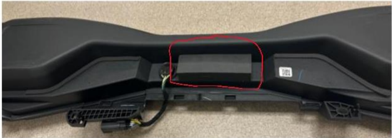
Fig 2. Foam Block Installation Location

Reinstall the speaker sound bar and perform the audio tone test to confirm the condition is improved.