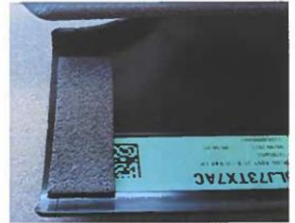
Fig 2. Sport Bar Trim Removed. Foam application shown.

This document does not authorize warranty repairs. This communication documents a record of past experiences. STAR Online does not provide any conclusions about what is wrong with the vehicle. Rather, it captures all previous cases known that appear to be similar or related to the vehicle symptom / condition. You are the expert, and you are responsible for deciding on the appropriate course of action.