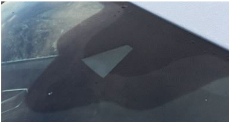
Figure 1: Windscreen fogged up on the outside

The front camera's field of view may be fogged up both on the inside and on the outside (see photos).