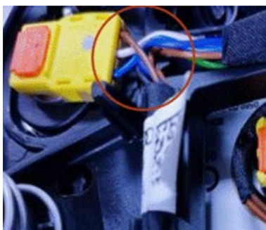
Figure 2. Check the routing of the wiring inside the driver airbag.