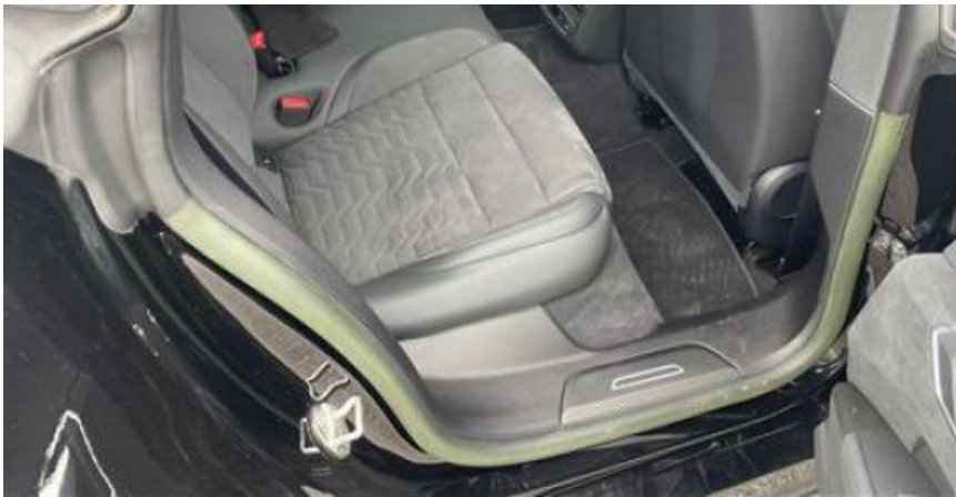
Figure 1: Example of the green discoloration.

The cause of the green discoloration is currently being analyzed (Figure 1).