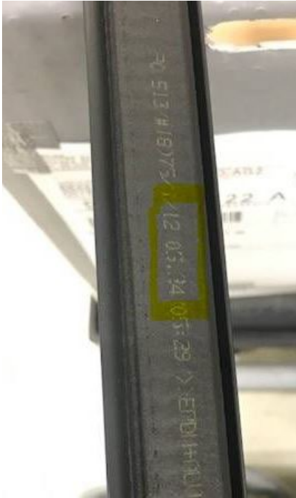
Figure 3: Depiction of manufacturing date/extrusion date.