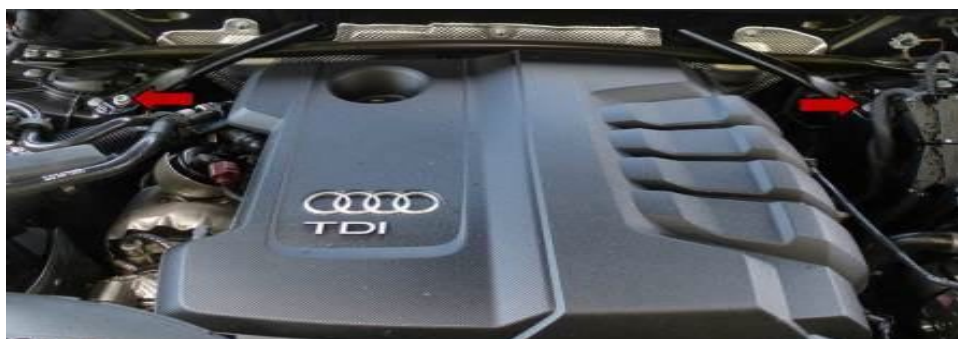
Figure 1. Example of tower brace for an Audi Q7.

2. If necessary, secure the bolt with the correct torque according to the repair manual and reassess the concern (Figure 1 and 2).