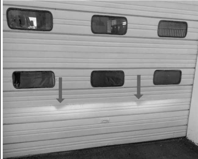
Shown in the picture above is an example for Encore, Encore GX, Envista, Trailblazer, and Trax headlamp. 6472911