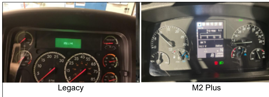
Figure 1 — Chassis Identification