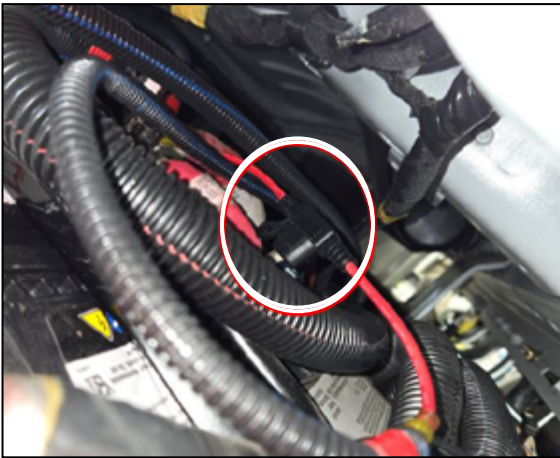
Figure 3 — 20 Amp Fuse