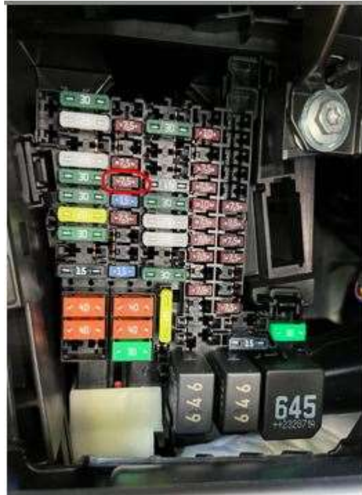
Figure 4. SC19