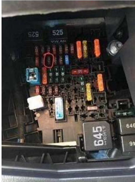
Figure 3. SC17