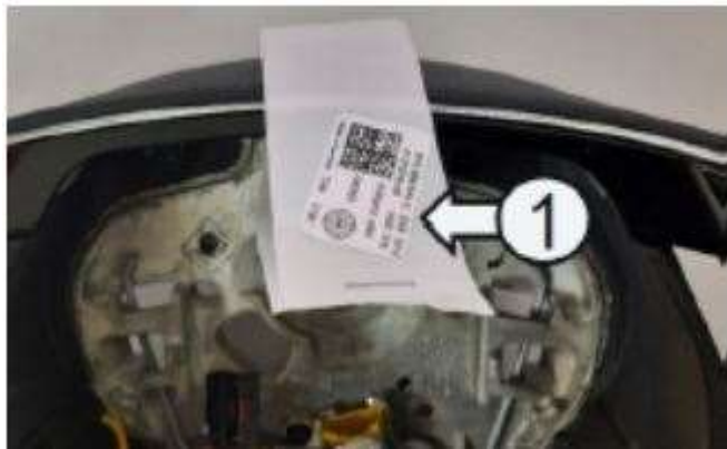
Figure1: New Label/Sticker

The new steering wheel will have the supplied label/sticker (see figure 1) that will need to be applied to the trim panel on multifunction button set, (see figure 2).