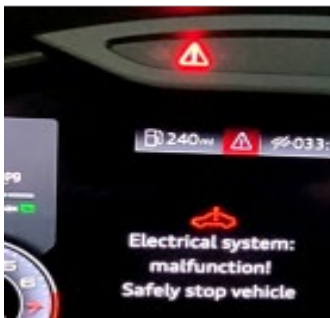
Figure 1. Warning lamp associated with message.