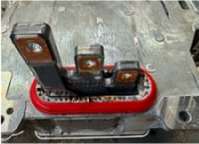
Figure 4: Corrosion on high-voltage system connection for power and control electronics for electric drive.

1) Corrosion on the high-voltage system connection for power and control electronics for electric drive (Figure 4).