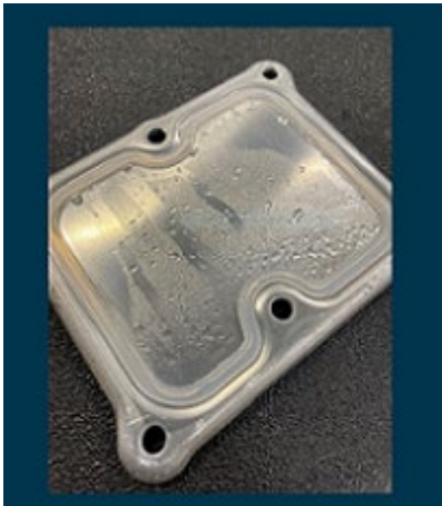
Figure 5: Condensation on high-voltage system connection cover.

2) Condensation on high-voltage system connection cover (Figure 5).