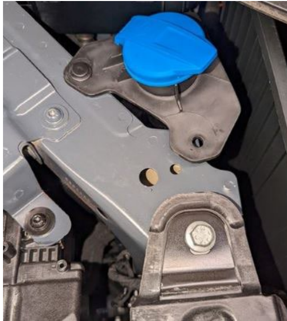
Figure 2. Removing filler connection.