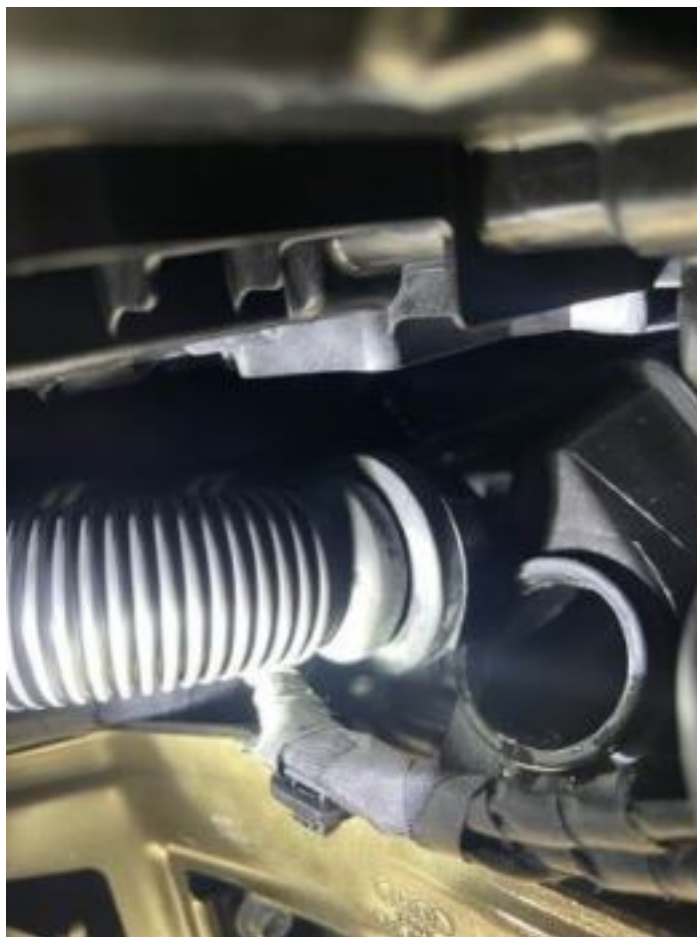
Figure 3. Detaching filler connection.