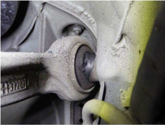
Figure 1. Damage to the rubber mounting.