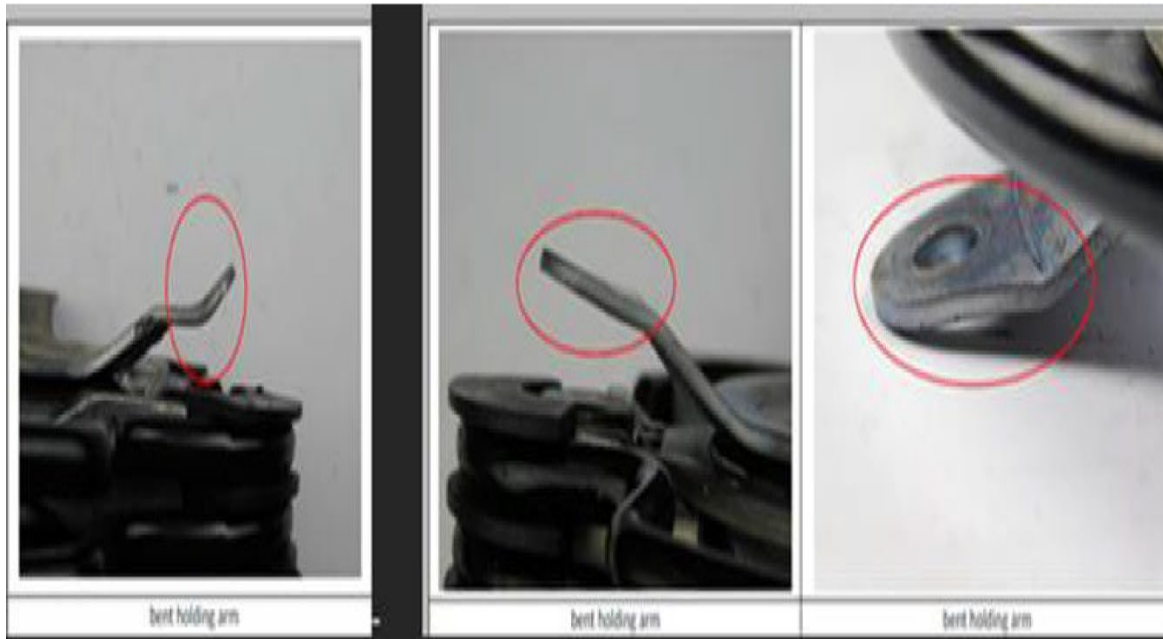
Figure 3. Examples of damaged parts.