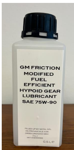
0.5 Liter Bottle shown

The oil is available in the following formats: