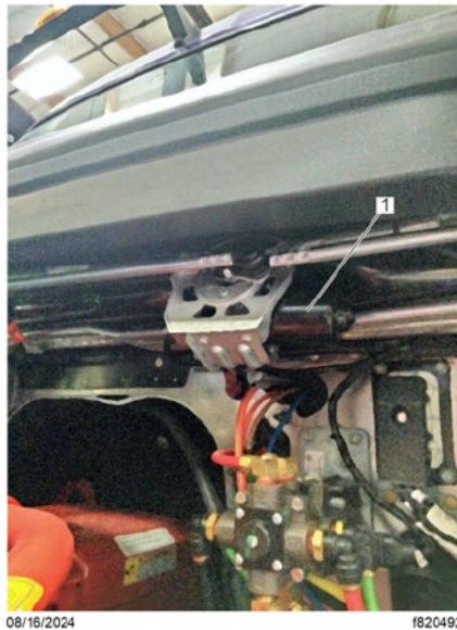
1. Wiper Motor

Some Western Star vehicles built prior to January 1, 2023 have a race condition with the wipe function. If the wiper motor receives power before the ASAM, the wiper sweeps once at key-on. This may result in a random unintended wiper swipe. ASAM controllers built after January 1, 2023 (ASAM2021), received new hardware and software that corrected for the unintended wipe. The ASAM21 controllers are not backward compatible and cannot be installed on vehicles built prior to 2023. Replacing the wiper motor will resolve the issue. See Fig. 1. Follow the procedure below to replace the wiper motor.