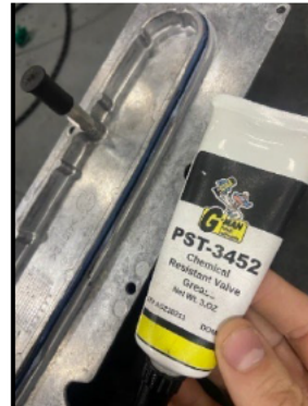
Fig. 4 Lubricant