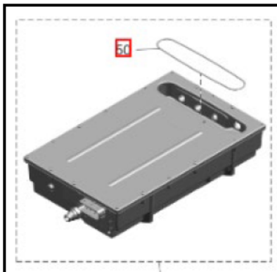
Fig. 3 O-ring