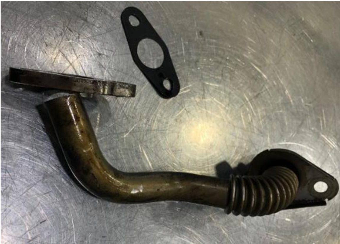
Example of a broken turbo oil return line

Some DD13 Gen 5 turbocharger oil return lines have cracked, causing an oil leak. Engineering is requesting additional steps and the return of replaced parts to aid with understanding the root cause. If completed, please return the parts directly to DDC. This process is only to be performed until January 1, 2025, and only when the customer approves of the additional repair time that may occur.