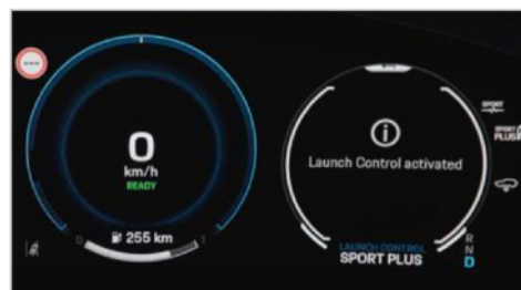
"Launch Control" display in instrument cluster