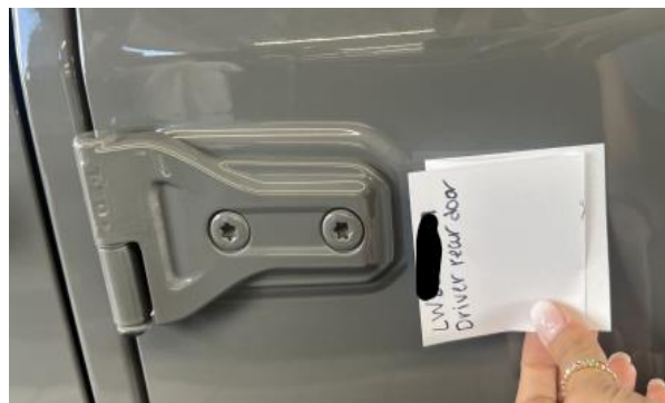
VIN Example (Fig. 3)

Dealers will need to take photos of the affected areas identified during the inspection to support the repair. A clear photo of the corrosion is needed and MUST include the VIN and affected body panel. The VIN and affected body panel can be included on a sticky note, written with a grease pen, a copy of the RO in the photo, masking tape, etc. (Figure 3)