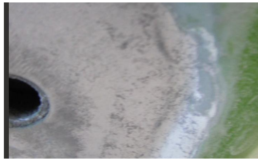
Pitting Found After Sanding Example (Fig. 1)

Note: If pitting is found during the sanding process, please use LOP 23-75-XX-XX for up to 0.5 hours in conjunction with the 23-85 replacement LOP.