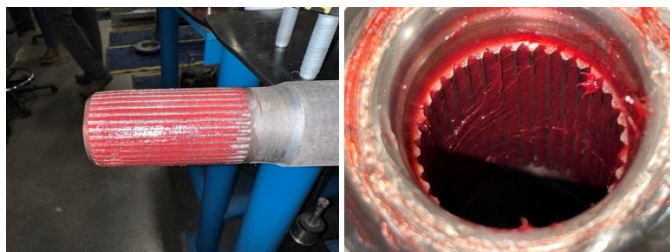
Fig. 2 Lubricated Axle Shaft/Hub Splines