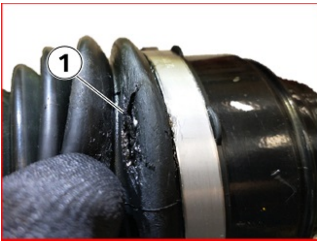
Tear or cut in the boot (1).

The below example is a boot that is dispersing grease around the outer carrier (1).