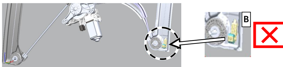
Figure 3, not OK.