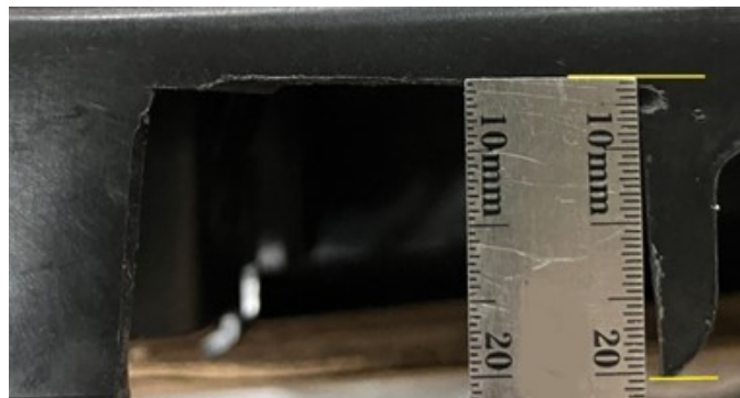
Fig. 2 Vertical Area To Measure And Cut