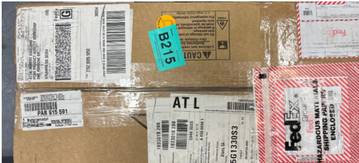
Figure 1: Porsche Part Number on Box label

Replacement modules are ordered by the currently designated Porsche Part Numbers. These part numbers are listed on the outer box label as shown in Figure 1.