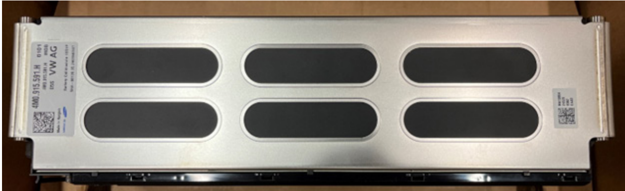
Figure 3: VW group number on module sticker

Once replacement stock of these part numbers is completely consumed, Porsche Part numbers PAB915591A and PAB915591 will supersede permanently to PAB915591J and PAB915591H.