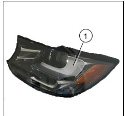
Combination light with AFS (1): Parking light/daytime running light (DRL)

NOTE: The combination light with AFS can be distinguished if it is equipped with the parking light/daytime running light (DRL) that illuminates while the ignition is turned on.