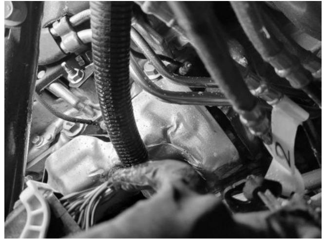
Left side exhaust manifold