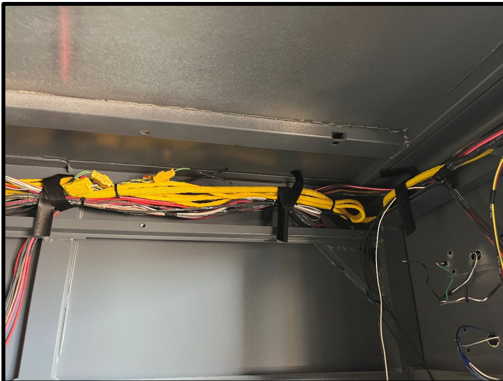
Crew Cab Upper Right Corner