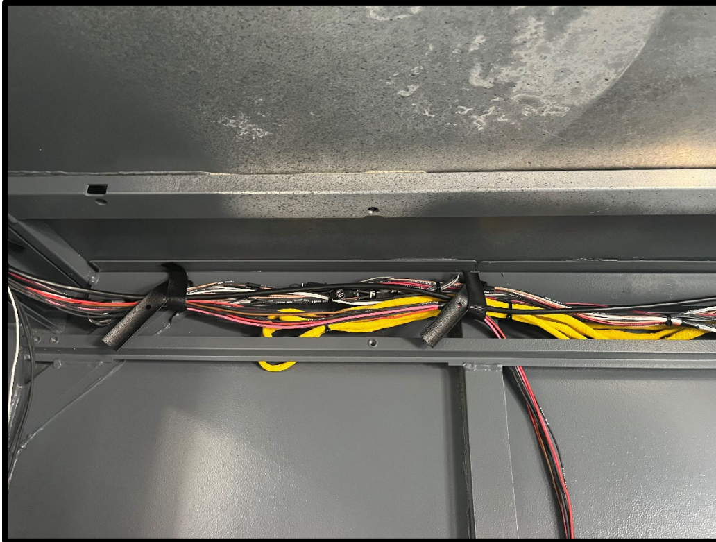
Crew Cab Upper Left Corner

Remove necessary cover panels as required to gain access to unused SRP legs containing resistors.