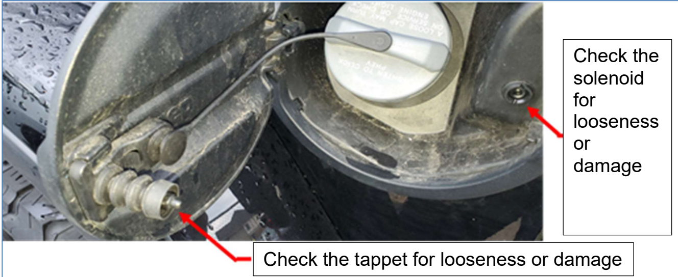
Fig 3 - Fuel Door Plunger Tappet and Solenoid