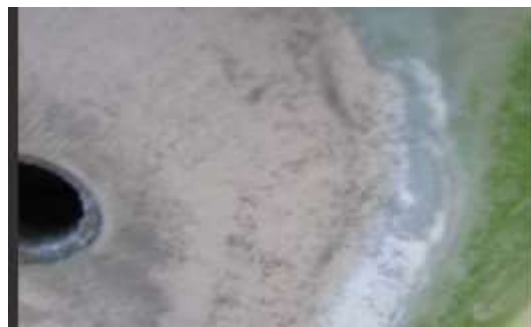
Pitting Found After Sanding Example (Fig. 1)

Note: If pitting is found during the sanding process, please use LOP 23-75-XX-XX for up to 0.5 hours in conjunction with the 23-85 replacement LOP.