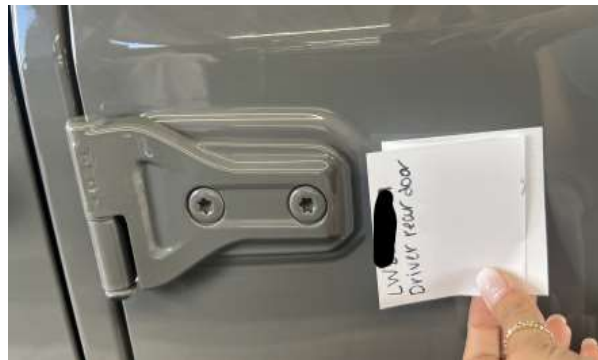
VIN Example (Fig. 3)

Dealers will need to take photos of the affected areas identified during the inspection to support the repair. A clear photo of the corrosion is needed and MUST include the VIN and affected body panel. The VIN and affected body panel can be included on a sticky note, written with a grease pen, a copy of the RO in the photo, masking tape, etc. (Figure 3)