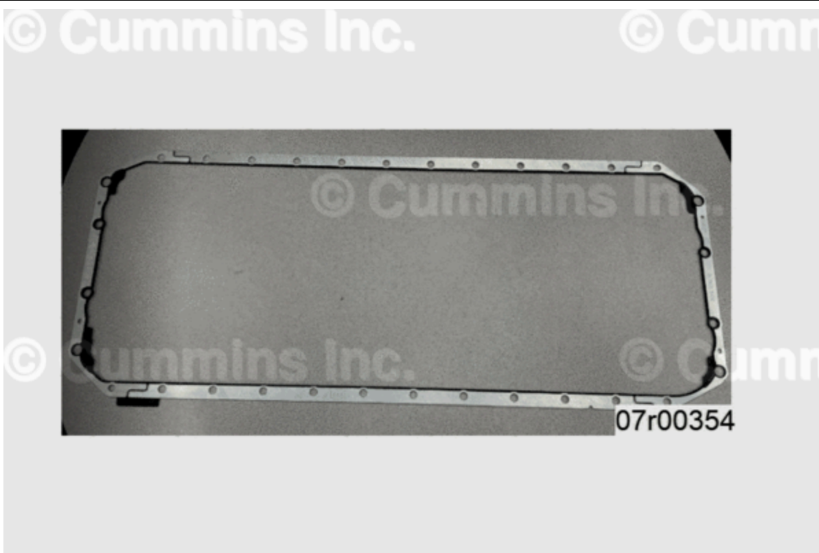
Figure 1, Lubricating Oil Pan Gasket, Part Number 5682084.