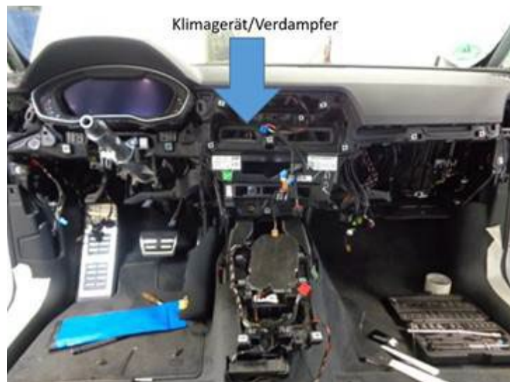
Figure 1. Air conditioning unit / evaporator.

On the vehicles listed in this TSB, the evaporator of the air conditioning system is a potential source of a leak. It is fitted in the air conditioning unit and is not easily accessible from outside (Figure 1).