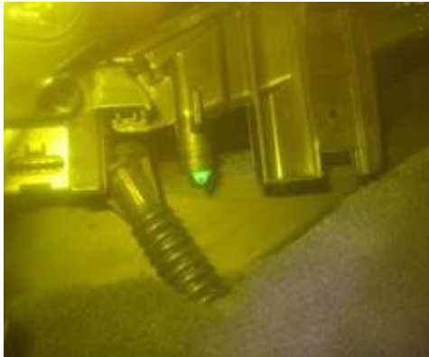
Figure 3. Leak detection additive at condensation drain.

· If a leak detection additive is put into the refrigerant circuit, deposits of the additive will appear on the condensation drain after the air conditioner has been operated at high load for a sufficient time (Figure 3).