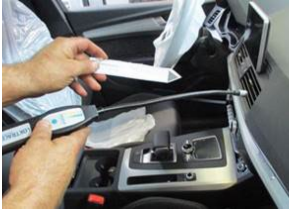
Figure 2. Electronic leak detector at center vents.

· Check whether the electronic leak detector finds refrigerant on the center vents (Figure 2). To do this, select the following air conditioner settings: Blower on lowest level and air distribution set to dash panel vents.