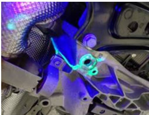
Figure 4. Leak detection additive under vehicle.

5 You can also check this on the vehicle's underbody (Figure 4).