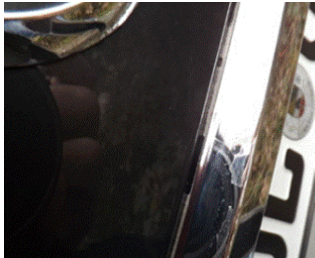
Figure 2. Debonding tail lamp trim molding with a visible gap.