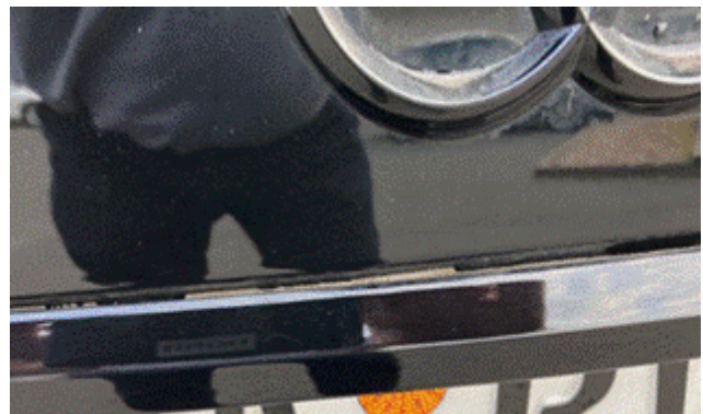
Figure 1. Tail lamp trim molding loosening.

The bonding strip that affixes the center section of the tail lamp trim molding to the rear lid surface has weakened. The trim strip has pulled away to the extent that a gap can be seen.