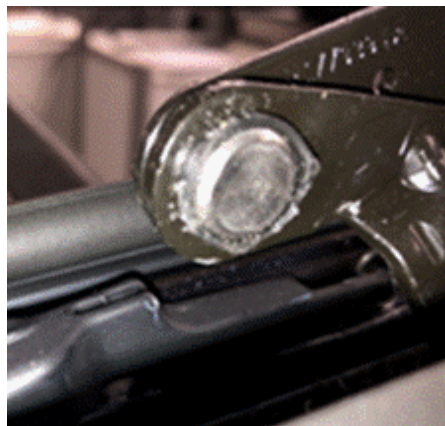
Figure 5. Water guidance washer on the front frame mechanism pivot.