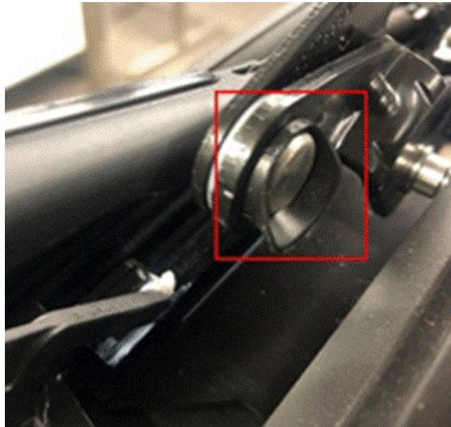
Figure 3. Water guidance washer on the front frame mechanism pivot.