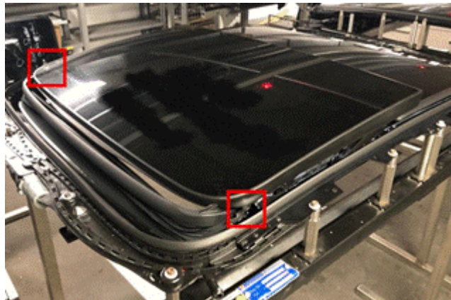
Figure 2. Front sunroof glass panel side skirt protrusion from an unmodified water guidance washer.