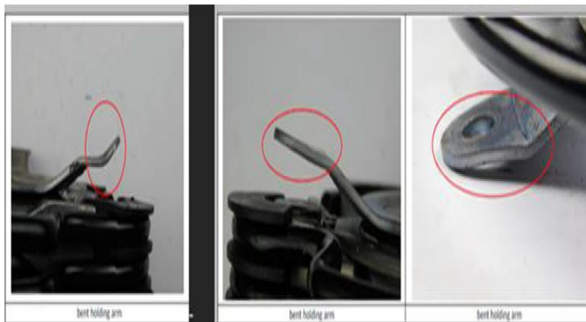
Figure 3. Examples of damaged parts.