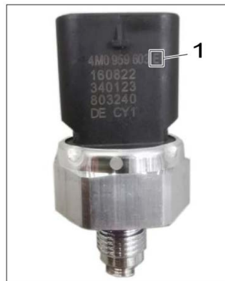
Spare part index for pressure sensor